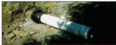
Adjacent sections of lined pipe were bridged by a new steel pipe which was joined to the lined pipe with special couplings.

The McLaughlin engineers were concerned about using the liners because neither was designed to withstand the required pressure. Both technologies would have to rely upon the host pipe for support. As a result, representative samples of the pipe were inspected carefully and coupons from the pipe were tested for strength. After an exhaustive study, the technologies were